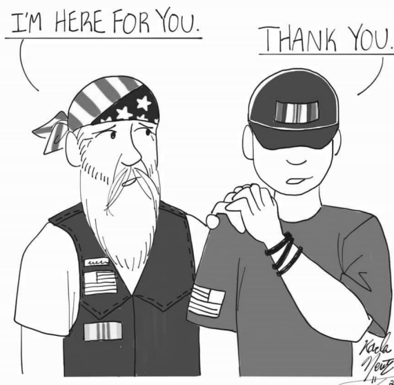
GWOT Vets — Your Service Mattered. You kept the wolf from our doors for 20 years

When you don't know who to call at the Veterans Administration : 1-800-MyVA411 (800-698-2411) is the one number to call