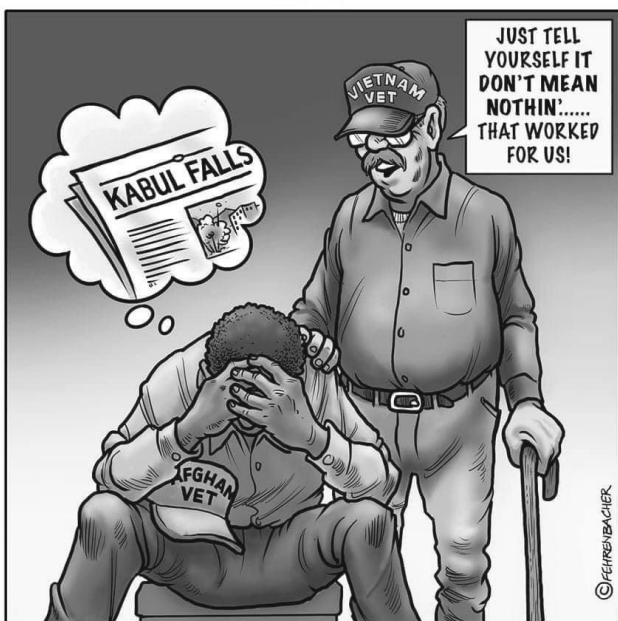
THINKING OF OUR AFGHAN BROTHERS AND SISTERS...