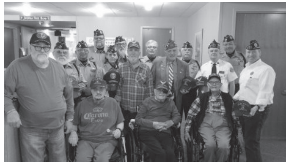
All Proud Veterans

On Monday, 30 January several American Legion Post 76 members distributed Service caps to residents (US 60 Army, 41 Air Force, 34 Navy, 11 Marine Corps, 1 Coast Guard Veterans, and 34 spouses of Veterans) of the Nevada State Veterans Home in Boulder City. All the caps, with Service-unique logo and a “Thank You for Your Service” inscription, were presented personally to each Veteran of the Home. The Home staff were very generous and cordial in their efforts to help reach out to each and every Veteran at the Home to present their caps. It was a day of honor and gratitude for all the cap presenters and the Veteran recipients.