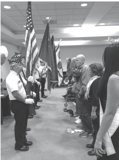
Post 76 Honor Guard at Grant Sawyer

Post 76 is scheduled to participate in the VIC Program with an Honor Guard at several other senior living facilities in 2017.