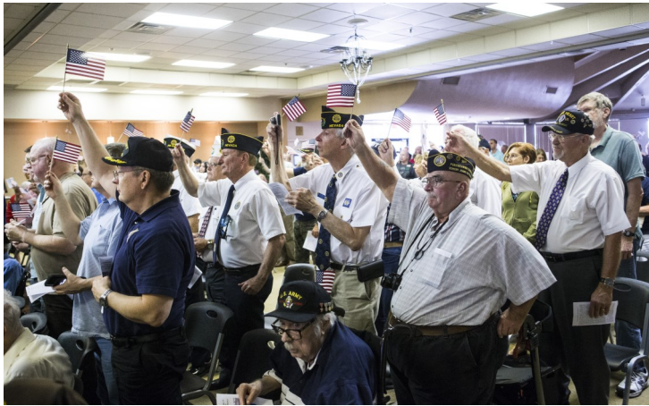
Post 76 Legionnaires raise their flags during the signing of "God Bless the USA"