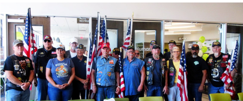
Patriot Guard Riders of Southern Nevada preparing to stand flag lines during the ceremony

Although this was not a formal Patriot Guard Riders mission, 15 Southern Nevada PGR members attended the grand opening ceremony. This was a great opportunity for the PGR members to meet some new people