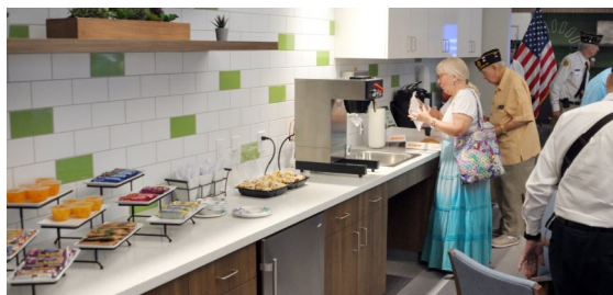
Ample refreshments were provided in the main lobby of the Neighborhood Center