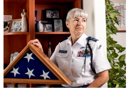
Bobi Oates

Number of Veterans: Nevada 218,406 Nationally 19,998,799 10.3% 6.6% Number of Women Veterans: Nevada 21,715 Nationally 1,882,848 9.94% 9.14%