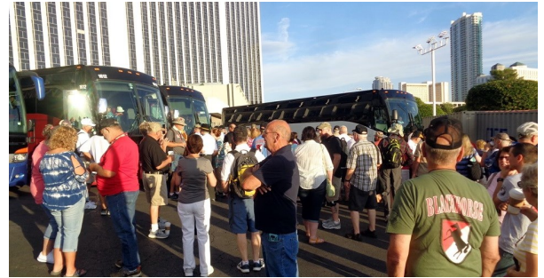
11th ACR waiting for buses at the Westgate