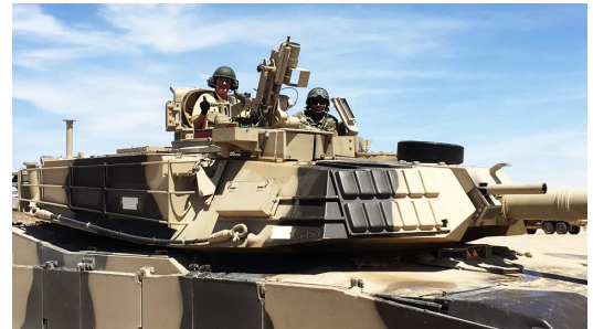
Back in the saddle again (but on a very different steed that Vietnam or Germany)! At Fort Irwin visiting the Regiment as part of the reunion.

The Regiment once again unfurled its col-