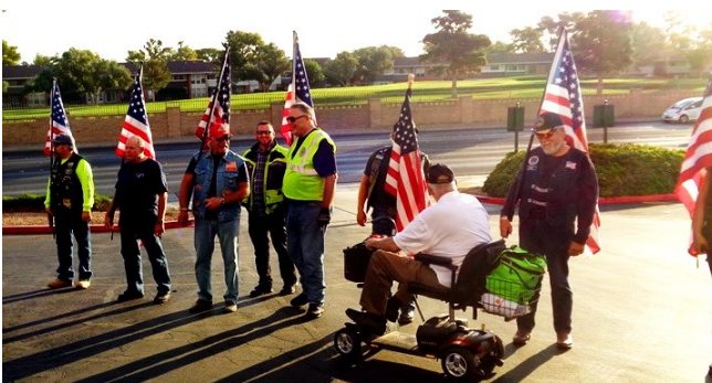
Just part of the Southern Nevada Patriot Guard Riders flag line at the Westgate

ors in Germany on May 17, 1972 as it replaced the 14 th ACR. Now they were guarding the famous Fulda Gap. In the event of a conventional war in Europe, the Blackhorse would serve as the covering force for V Corps. In peace time, their job was surveillance and deterrence along a 385 kilometer section of the East/West German Border. The importance of the "Fulda Gap," passages through the Rhön Mountains, was that it offers any attacker from the east the shortest route across the middle of West Germany and the ability to seize the Rhine River crossings at Mainz and Koblenz.