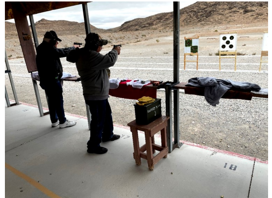
Athos & Porthos During a Rare Rain Stoppage