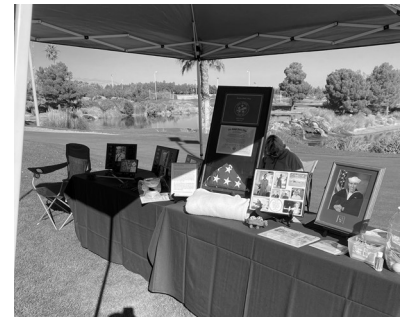
Display set up at the John H Hilgar II Putting Tournament and Birthday Celebration

This patch is now available for a suggested donation of five (5) dollars and will be sold at meetings at the back table.