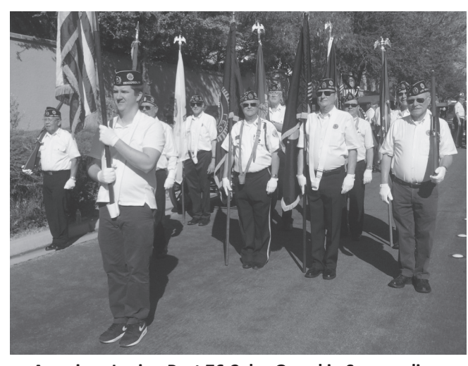
American Legion Post 76 Color Guard in Summerlin Patriotic Parade—July 4th

marched proudly along the downtown Summerlin parade route