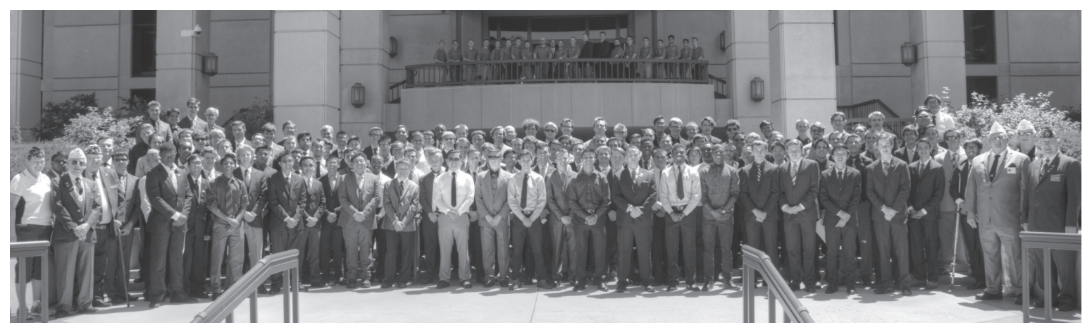
Boys State 2016 group photo. What a large turnout this year!

The drawings for the raffle/National Finals Rodeo will be on November 20<sup>th</sup> after our regular meeting.