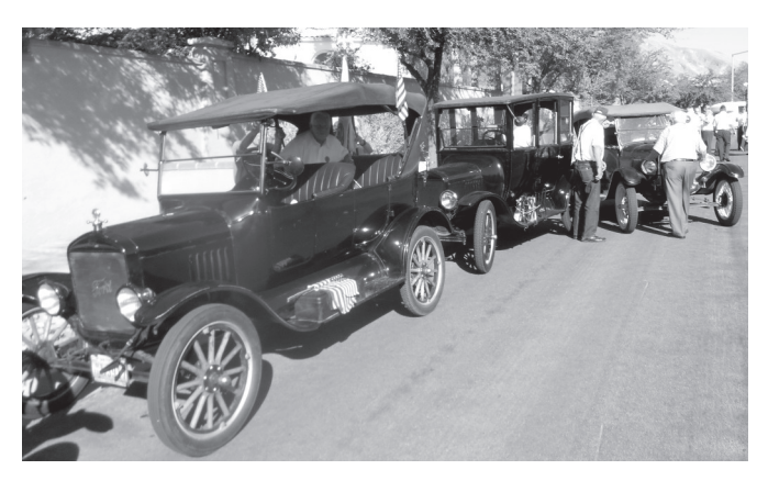
Las Vegas Model T Club provides transportation for Post members wanting to ride.

Our Color Guard Sets a record on July 4<sup>th</sup> 2016! It was a memorable day for Post 76! Your Post 76 Color Guard participated in the Summerlin Patriotic Parade on July 4<sup>th</sup> and set a few records along the way. The Color Guard had enough ablebodied volunteers to carry 9 flags (US, Nevada, American Legion, POW/MIA, Army, Air Force, Navy, Marine) and 2 rifles—the first time in recent memory that the Post could muster enough resources to accomplish this feat. The entourage