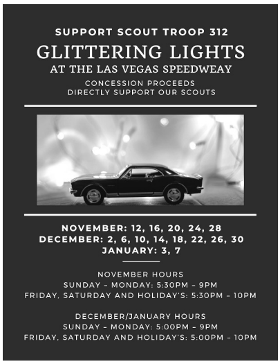
The scouts participated in a major way in the Glittering Lights by selling Hot Chocolate to help them earn for their