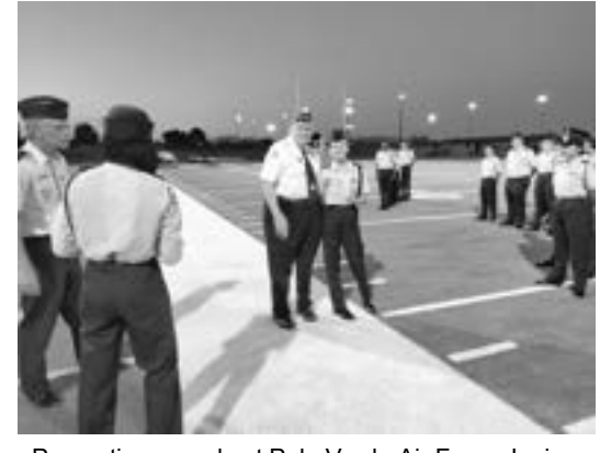
Presenting awards at Palo Verde Air Force Junior ROTC ceremony.

This started off slowly, but finished with 2 Brand new Legion members, 1 Post 100 transfer & 1 Post 76 renewal. Thanks to all who gave their time to aid our veterans.