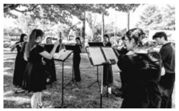
Silver State Flute Choir performed before the ceremony

The ceremony at The Lakes, organized by the American Legion Nevada Post 76, drew nearly 200 people including several members of the Gold Star Wives of America.