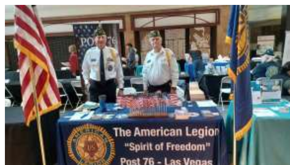
At Galleria Mall — Humana Veterans Expo