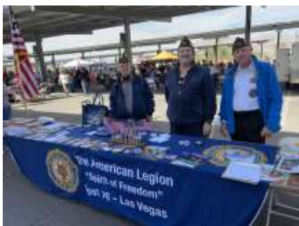
At the VA Car Show and BBQ