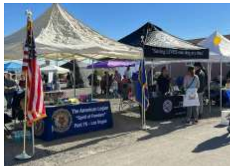
At the North Las Vegas Block Party