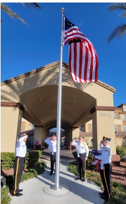
Saluting the flag that needs to be taken down ceremonially and replaced with a new flag.

The Post Color Guard presented the Colors on Wednesday 15 February 2023, at the Red Rock Point Retirement Community, 4445 S. Grand Canyon Dr. Las Vegas 89147 for the Veterans in Care Ceremony with Nevada Department of Veteran Services. In addition, the Color Guard was asked to retire a large, damaged United States Flag from the flagpole in front of the facility and replace it with a brand new flag. This was accomplished with no injuries to anyone. Another service to add to our resume'.