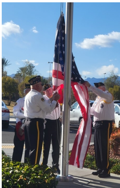
The new flag being prepared to be hoisted up the flagpole